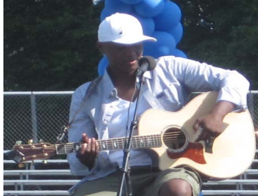
Javier Colón performing at Bunnell High School in Stratford, CT for a Welcome Home Tribute .

He addressed the crowd of well wishers and sang a couple of songs including his single “Stitch by Stitch.” a top-selling song on iTunes. Javier will be performing at the University of Hartford on Saturday, October 22 at 7 P.M. at the Lincoln Theatre.