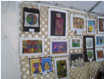
This is the student art show at the WHEA booth.