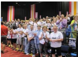
This is the Connecticut delegation on the RA Floor.